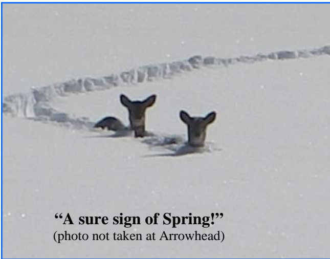
“A sure sign of Spring!” (photo not taken at Arrowhead)