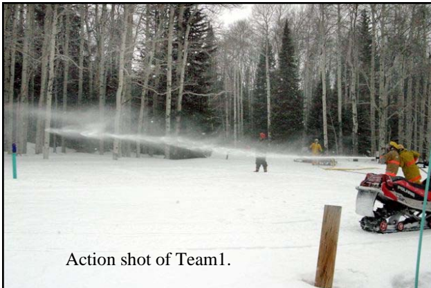
Action shot of Team1.