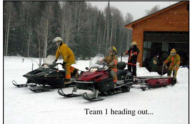
Team 1 heading out...