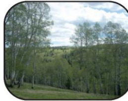
-1521 SPRUCE- Fantastic Views - 3/4 Acre Lot ready to build or RV Use. Water, Electric, Septic Installed. Gravel Driveway & RV Pad. $52,000.