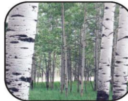
-253 HAZEL LAKE- Serene Lot!! Pretty 1 Acre Corner Lot with nice tree mix. Bring All Offers!! Motivated Seller! $32,000.