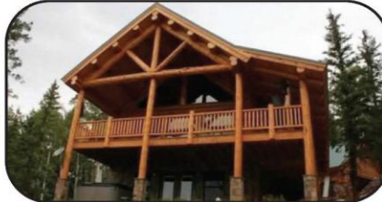
ELEGANT CUSTOM LOG HOME WITH EXPANSIVE VIEWS!!!! Gorgeous quality built home with UPGRADES!! 2528 SQ FT. 3 BR, 3BA. 2 Car Detached Garage. Gourmet kitchen. Stone fireplace. Open to Trade/Exchange! 1601 SPRUCE $475,000.