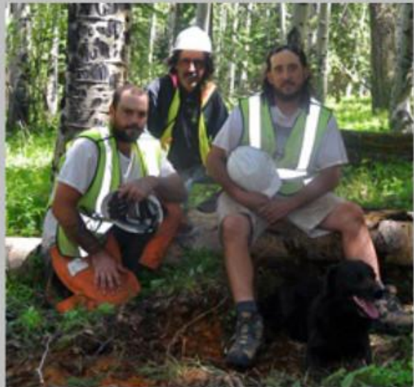
Mitigation & Lot Clearing