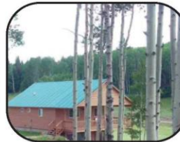
-325 PONDEROSA-FURNISHED 3 br 3.5 ba 2240 sq. ft. Covered deck. Ranch style with walk out basement. Storage shed. RV hookup. Views of Flint Lakes and West Elks mtns. $270,000.