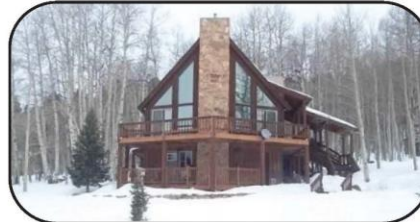
SWEEPING VIEWS! Beautiful cabin w/ quality finishes. So Many Upgrades!! 2767 SQ FT. 3BR, 2 BA. Open kitchen, Stainless Appliances, Slab Granite, Hardwood floors. Perfect for entertaining!! 188 PONDEROSA $445,000.