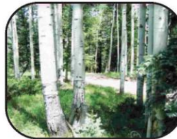
-130 RIDGE - Nice Mix of Aspen, Pine & Spruce Trees! 1 Acre Lot with prospective views to NE. Septic & Electric Installed! Water line w/ frost free faucet. RV pad. Good Location!! $44,000.