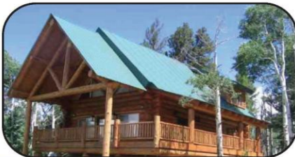
-663 CREST- BIG VIEWS! Beautifully furnished. Ready to move in. Large 2 br 2 ba. Unfinished walkout basement. 2576 sq. ft. Frontier log home. Don't miss this one! $385,000.