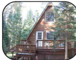
-1800 SPRUCE- A MUST SEE!!! Adorable 2 br 2 ba cabin. Fully furnished. Front and back decks to enjoy the cool mountain air and wildlife. It's a steal at $159,500.