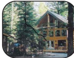
-321 BALSAM- ADORABLE with ADORABLE touches. Custom built 3 br 2 ba cabin. Turnkey. Fully furnished. Hot tub. Detached garage. A must see! $299,900.