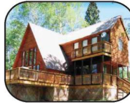
-721 SPRUCE- GORGEOUS Views of San Juan Mountains! Brand New Deck To Entertain On. Open concept living with vaulted ceiling in LR. Master BR views & deck, sleeping loft and 2 baths. $239,000.