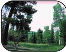
-463 UTE- Private 1 acre lot. Away from roads. Nicely wooded with meadow area. Fantastic to build your mountain cabin or develop for RV use or camping. $35,000.