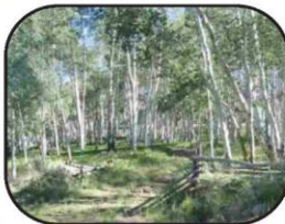
-1471 SPRUCE- Knockout View of San Juan Mountains. 3/4 Acre Lot is already set up for RV use w/ level gravel RV pad & deck. Water, Septic & Electric installed. $49,000.