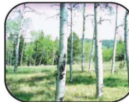
-1101 SPRUCE- IDEAL LOT-3/4 acre. Paid water tap. Owner carry terms! Also open to trade or exchange. Bring all offers!! $58,000.