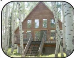
-190 RIDGE-FURNISHED- 2 br, 2 ba. getaway cabin! Vaulted ceiling, large windows, wood burning stove, breakfast bar. 1 acre level lot w/ beautiful mature trees. $172,500.