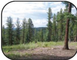
-205 SPRUCE- IMPRESSIVE VIEW toward west of mountains & valley! 3/4 Acre Mountain Lot. utilities installed. Water, Electric, Septic. Very Private and away from road. Pictures do not do justice to this beautiful lot!! $79,000.