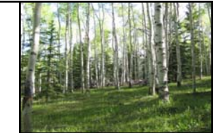
310 CREST DRIVE $42,000