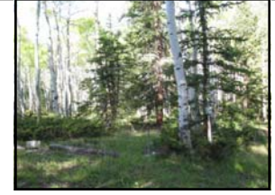
304 CREST DRIVE $56,000