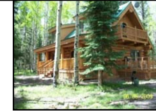
301 CREST DRIVE $319,900