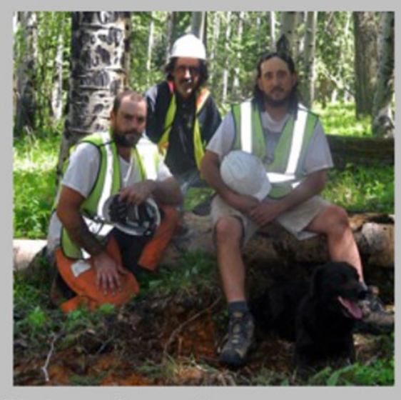
Mitigation & Lot Clearing